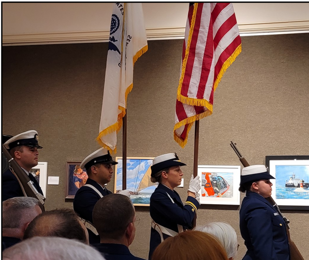
Members of the Coast Guard Sector New York Color Guard arrive for the opening of the 2023 COGAP Art Acceptance Ceremony.