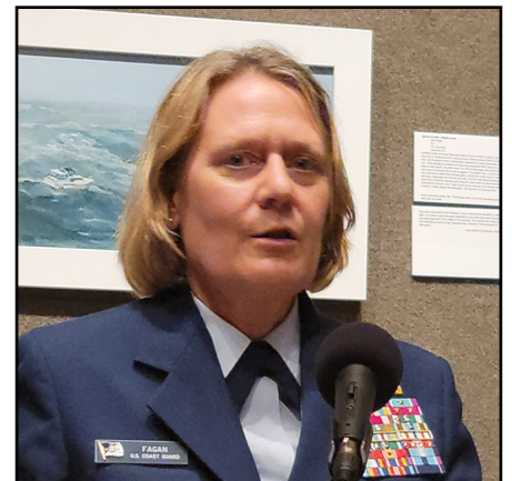
Coast Guard Commandant Adm. Linda Fagan accepts the 2023 collection on behalf of the Coast Guard.